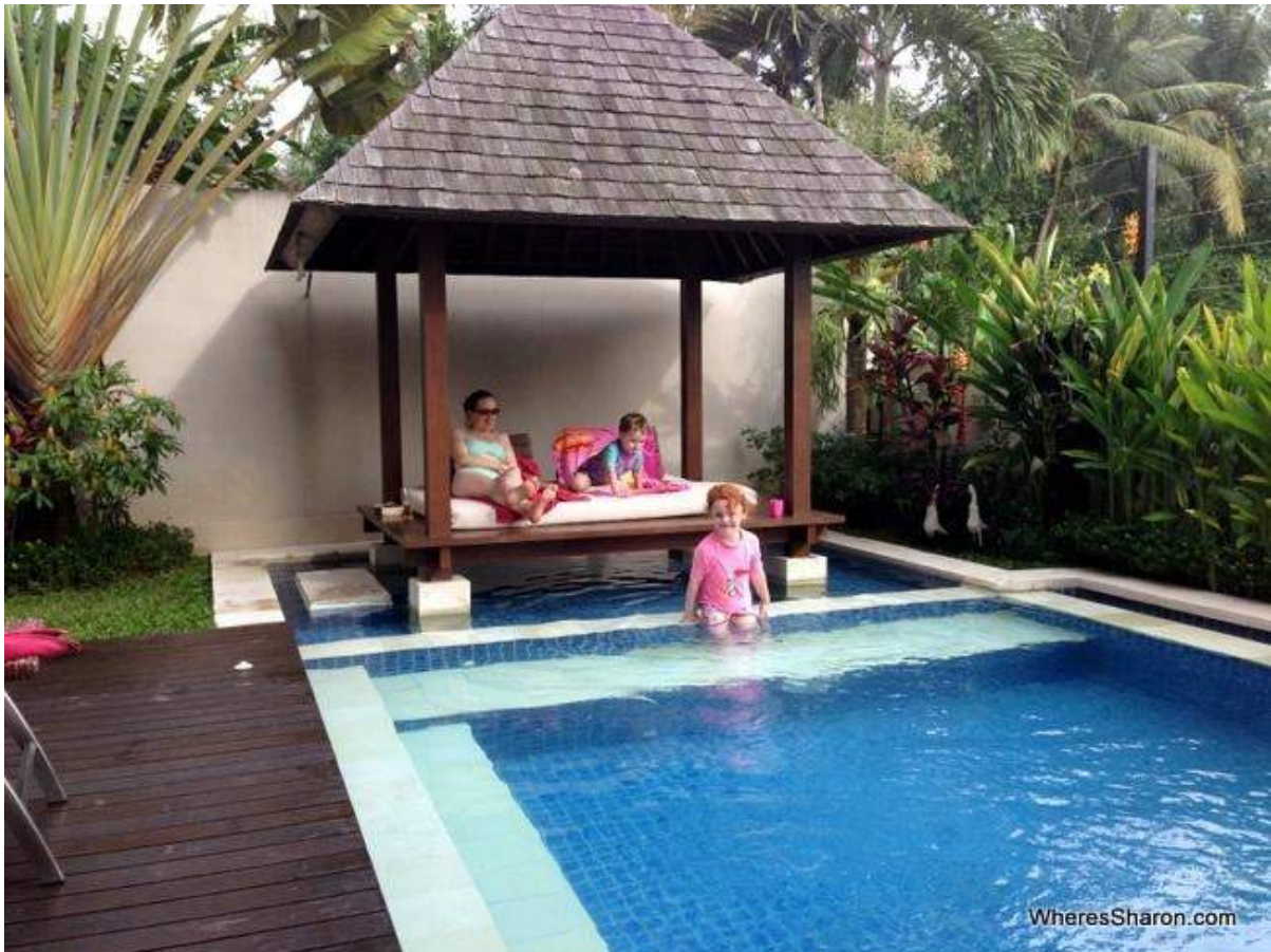
We loved our private pool villa in Ubud

For bookings, we recommend using HotelsCombined . It shows all the best prices across a wide range of hotel booking engines.