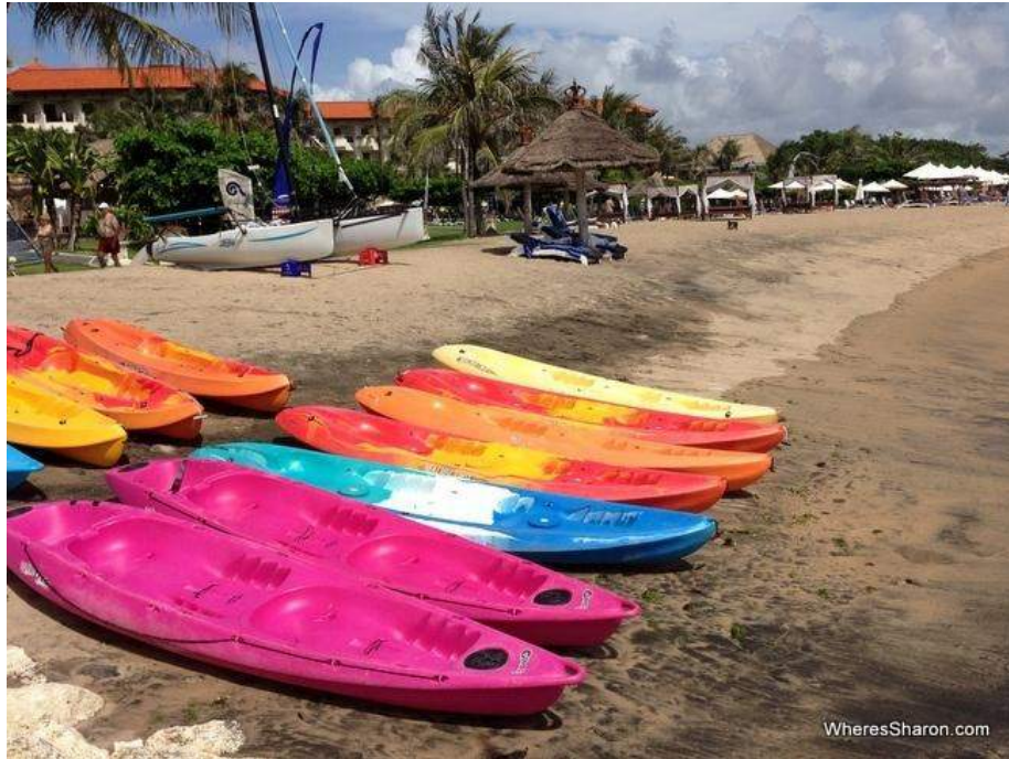
Beach at Tanjung Benoa, Nusa Dua