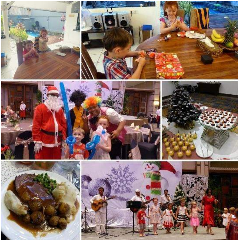
Some Christmas highlights

We spent a fabulous Christmas in Bali in 2015. We chose Bali because we thought that there would be enough Australian tourists that we would be able to get a good lunch like we would have at home – this was very much the case.