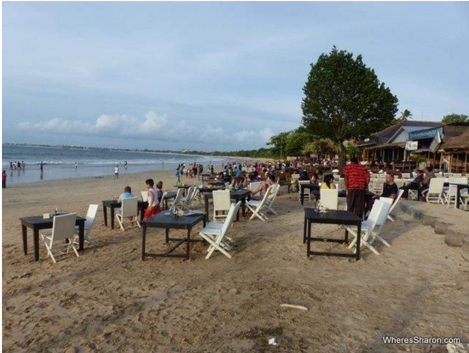
Jimbaran seafood shacks