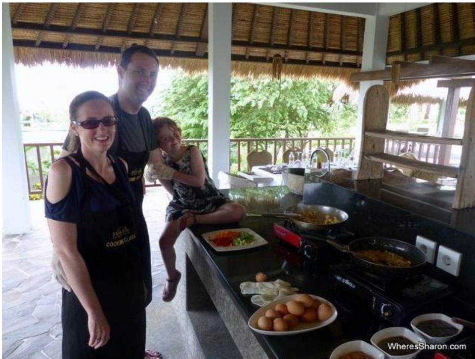
A cooking class is a great Bali family activity

Kids generally love cooking so a cooking class can be a great thing to do in Bali with family. They are readily available and our 4 year old loved it.