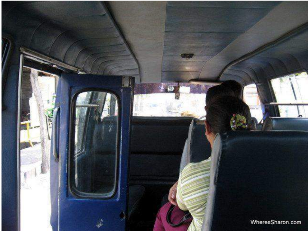
Catching a bemo to Denpasar