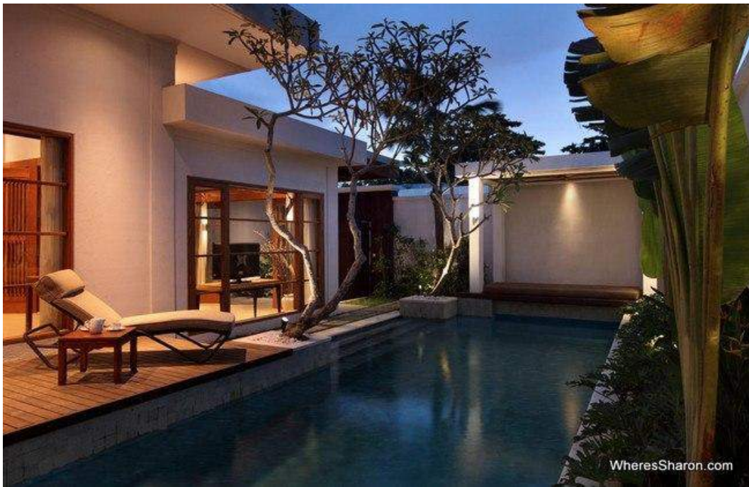
Private pool villa

This is another great choice for families looking for private pool villas by the beach.