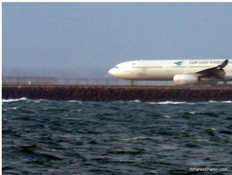
Watching a plane take off from Jimbaran

Bali is a popular destination and as such there are plenty of flights into Bali, particularly from Australia and the rest of South East Asia. People coming from further afield may need to connect somewhere else in Asia, such as in Singapore or Malaysia.