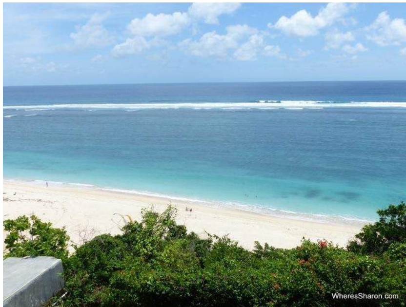
Our private beach in Nusa Dua

There are many beaches in Bali and it is not hard to find one. Sanur is particularly recommended for a family friendly beach.