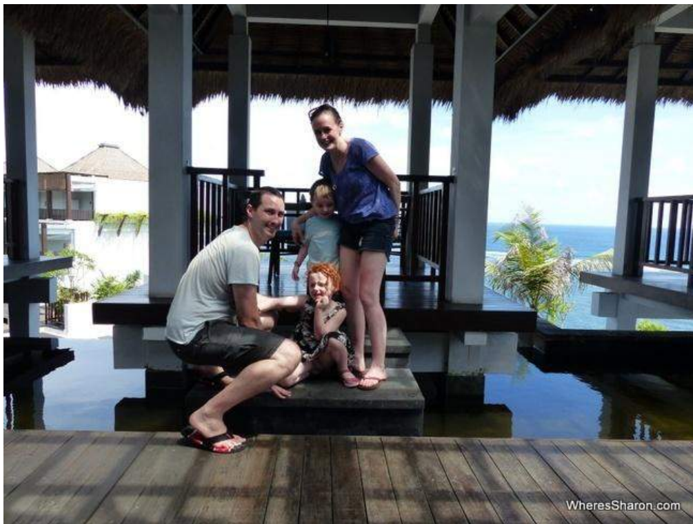
We dressed the same as home

If you are wondering what to wear in Bali then most things are fine. Casual wear is what you will see most other tourists wearing. For kids, lightweight clothes that give good coverage for sun protection are the best idea.