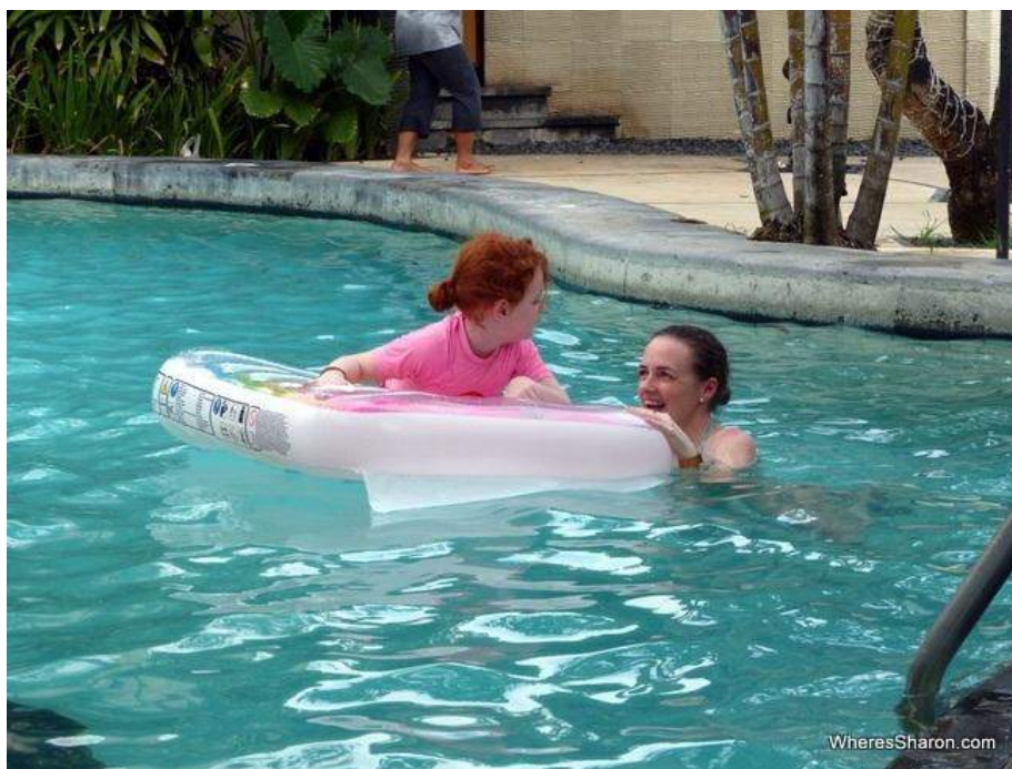
Pool time was always great family time