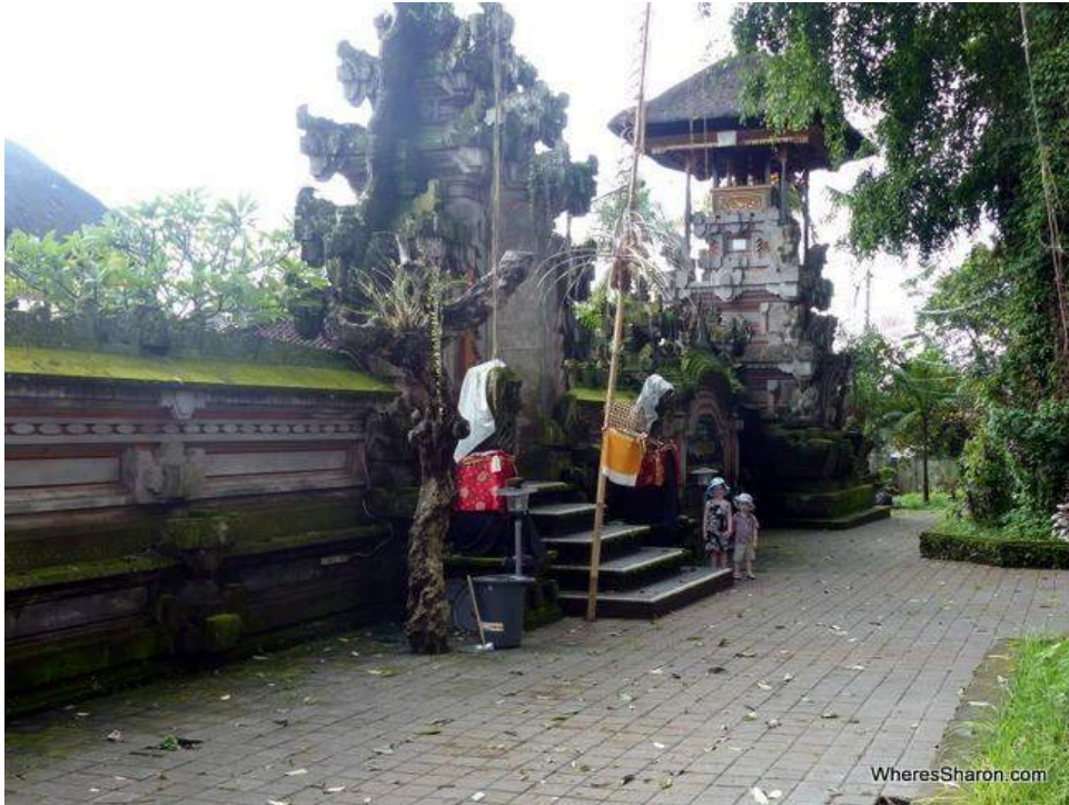
There are plenty of temples to visit in Bali