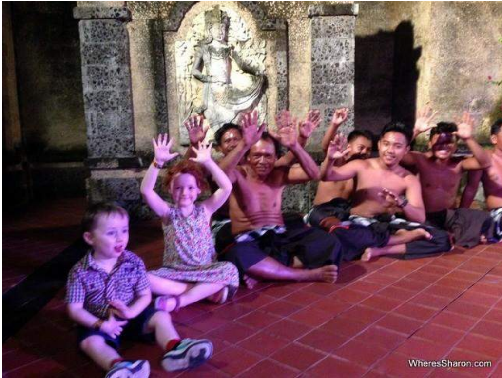
Balinese dancers were a hit with our kids