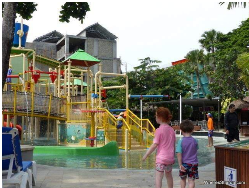
Funtastic play area at Waterbom Bali

Bali is a relatively small place so all these attractions can be visited from the areas mentioned above in a half or full day trip.