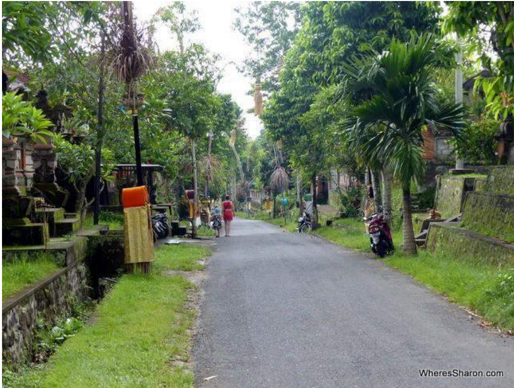
Our street in Ubud