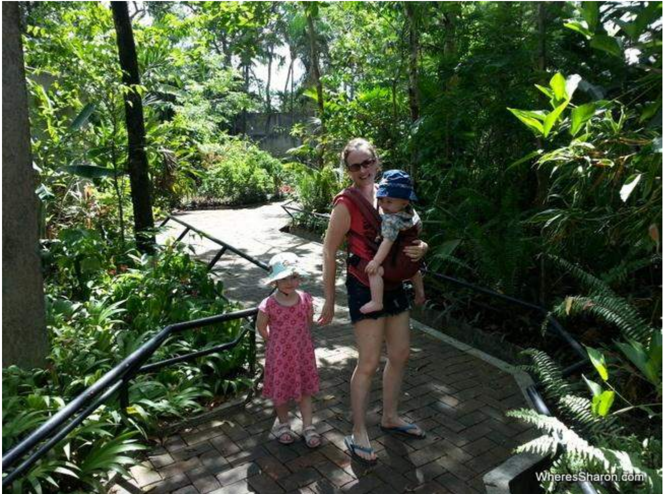
Rocking the Ergo baby carrier

I always say yes to the carrier – we particularly love travelling with the Ergobaby Carrier. It is so much easier than a stroller in places such as Bali where there is not nice footpaths.