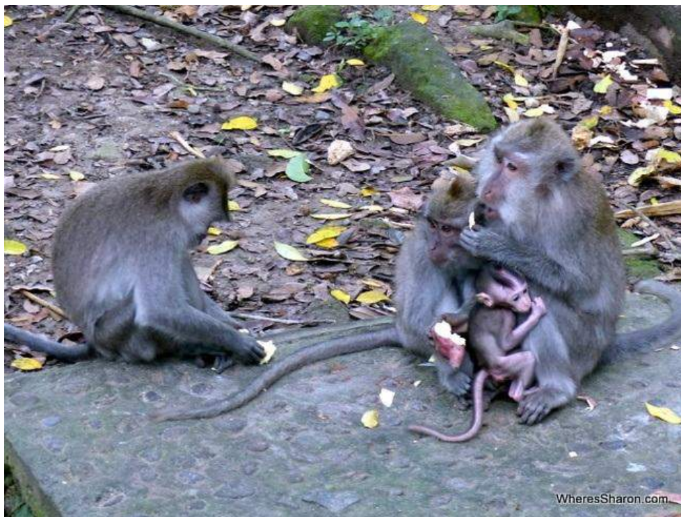
Sacred Monkey Forest

This is a nature reserve and temple complex in Ubud packed full of monkeys. It is great for getting up close with these creatures. However, I do not recommend it for younger kids as the monkeys kept attacking our preschoolers.