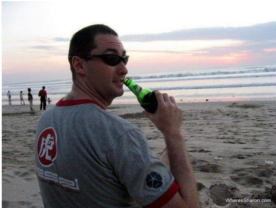
A beer on the beach in Kuta is a popular activity for tourists