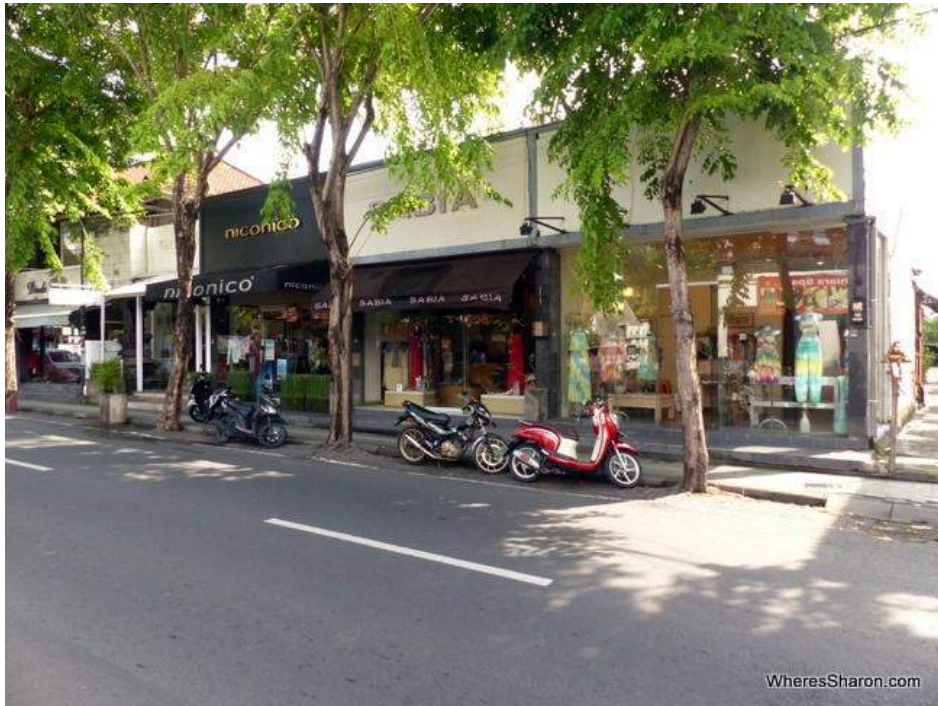
Street in Seminyak

Seminyak is an increasingly popular beach area to stay just up the road from Legian. It is known for being a bit fancier (and pricier) and is a great option if you are looking for the best family villas in Bali – many of these are here.