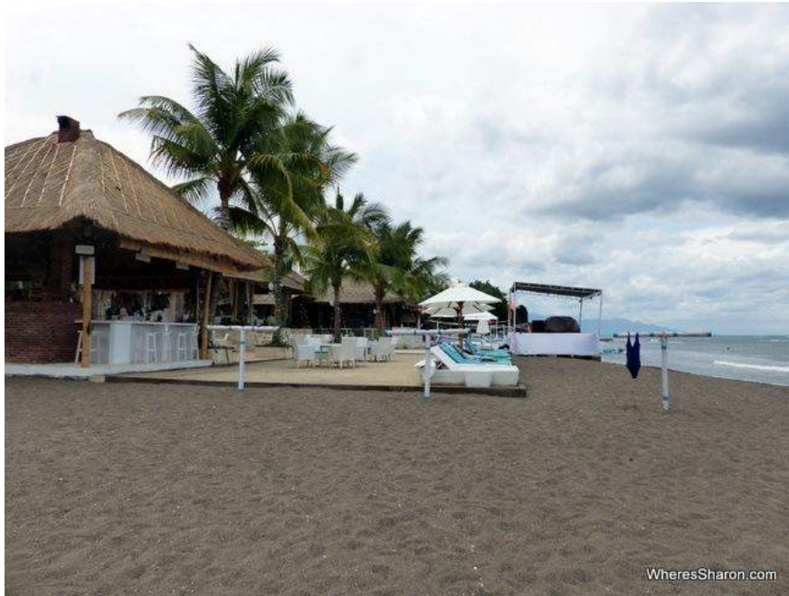
Spice Beach Club in Lovina