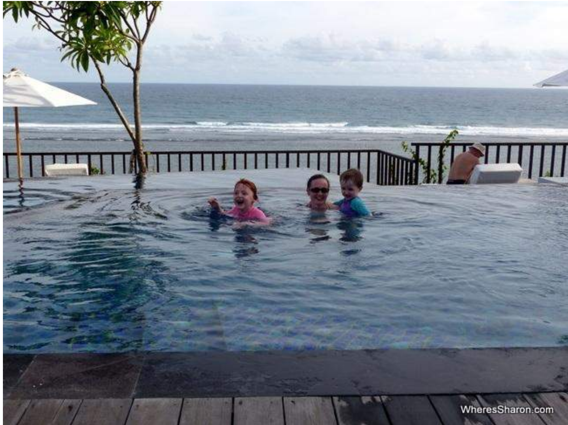
Enjoying the pool at the Samabe

Family accommodation in Bali is plentiful. You will have no problems finding something perfect for your needs. There are three main options you will probably look at – Bali family resorts, family hotels in Bali and family villas.