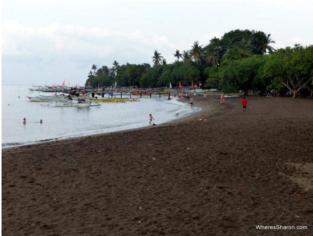
One of the beaches in Lovina