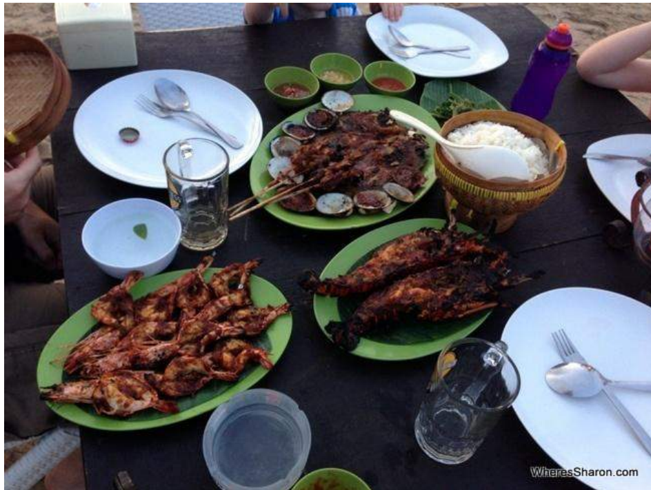
Jimbaran seafood feast